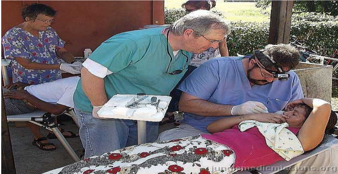
JungleMedic Missions at work

in 2005. The earthquake caused the collapse of the majority of health care facilities creating an extreme need for medical attention. 593 patients suffering from a variety of diseases were medically assessed by the HRO-medical team and medicine was given to all of them free of cost.